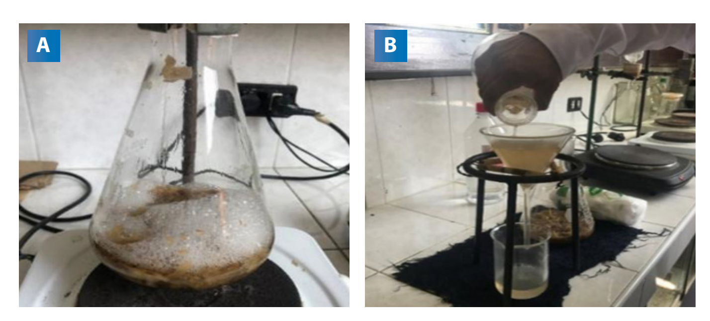
Figure 1. Preparation of 50% ethanol extract of Musa paradisiaca.

After the ANOVA test, the Post Hoc Bonferroni test was performed to compare the means of two groups, finding a statistically significant difference between each pair of groups (p<0.05) (Table 3).